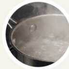
BOIL WATER NOTICES

CodeRED will only be used for emergency situations to keep you informed. These are just a few examples of why we may use CodeRED.