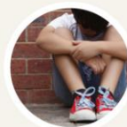
MISSING PERSON CASES